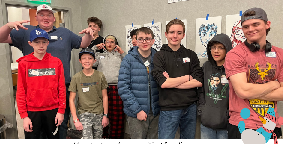
Hungry teen boys waiting for dinner because they, kindly, let the girls go first!